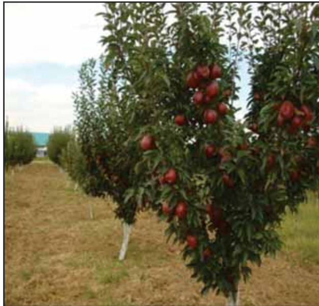
High Density Apple Cultivation (J&K)