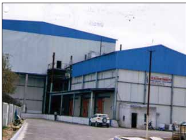
M/s R S Freezing &amp; Cold Storage Pvt. Ltd., Kundli (CA Store)