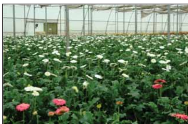
Gerbera under poly house

Under the scheme, the Board sanctioned 3622 projects during the financial year under report involving subsidy of Rs. 12588.89 lakhs . The projects includes Hi-Tech Horticultural Crops, Tissue Culture Units, Floriculture Units, Mushroom Cultivation, Establishment of Grading/Packing/Sorting, F&V Processing Units, Medicinal and Aromatic Plants and Refer Van etc.