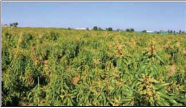
High Density Plantation of Mango in Sangli (Maharashtra)