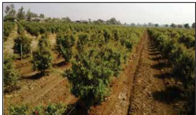
Pomegranate Cultivation in Maharashtra