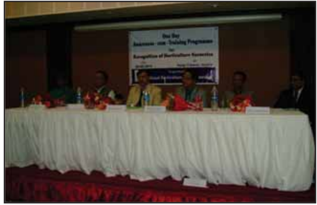
Awareness-cum-training programme for recognition of Horticulture Nurseries at Manipur on 26.02.2014