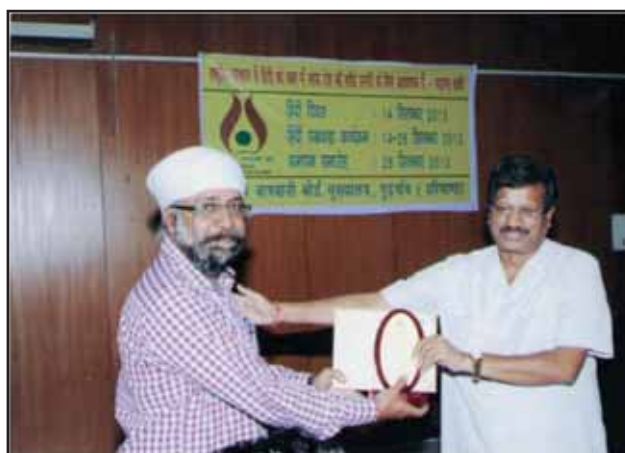
Prize distribution on closing ceremony of Hindi Pakhwada-2013 Organized at NHB, HQ (28th September, 2013)