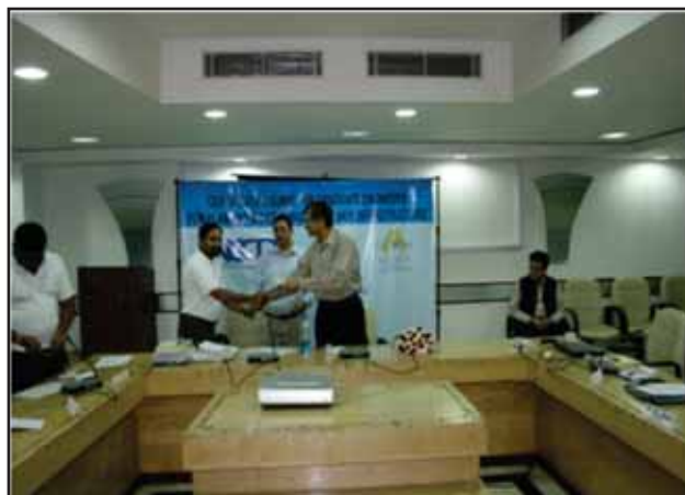
Inaugural ceremony to Graduate Engineers Training (Left) and Certificate distribution ceremony to Graduate Engineers (Right)