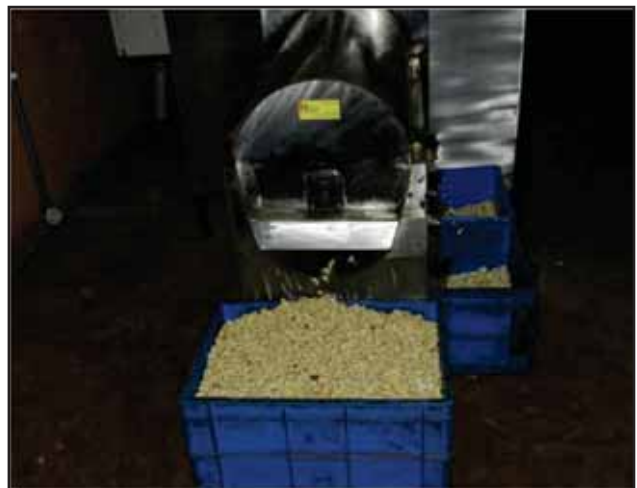
Automation in Cashew Processing in District Udipi of Karnataka State