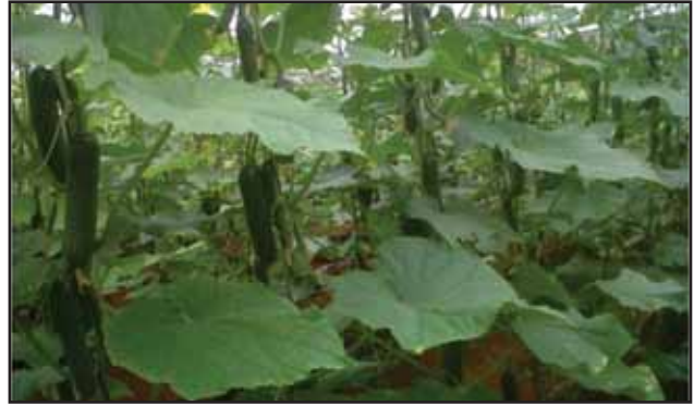
Cultivation of Tomato in Poly House & Cultivation of Cucumber in Poly House in Karnataka State