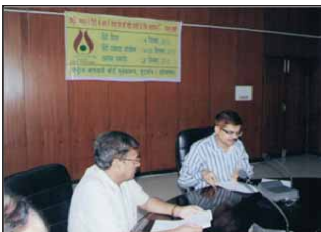
Hindi Diwas/Pakhwada-2013 organized at NHB, HQ (14th-28th September, 2013)