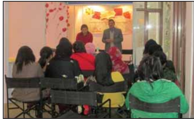
Mizoram Women Farmers Organic Festival from 22-25 January 2014 at INA, Dilli Haat, New Delhi

National Horticulture Board has strived to record some significant achievements in the following aspects.