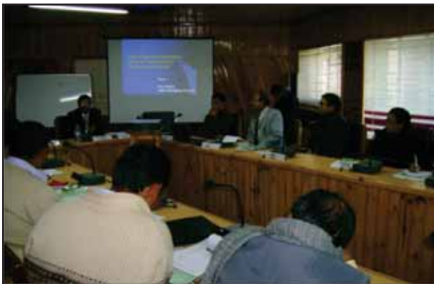
Awareness-cum-training programme for recognition of Horticulture Nurseries at Meghalaya on 19.02.2014