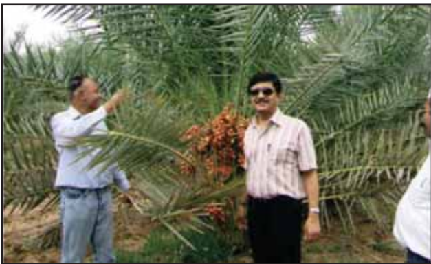
Plantation of Date Palm In Kutch (Gujarat)