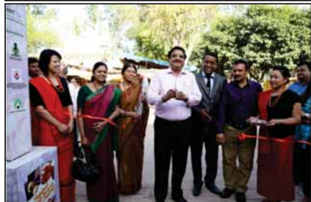
Nagaland Women Farmers Organic Festival from 19-23 March 2014 at INA, Dilli Haat, New Delhi