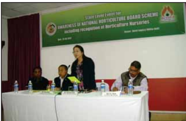
Awareness-cum-training programme for recognition of Horticulture Nurseries at Nagaland on 26.03.2014