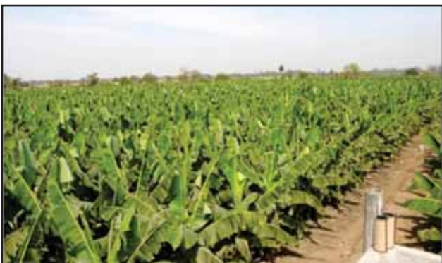
Banana Cultivation in Open Field in Gujarat State