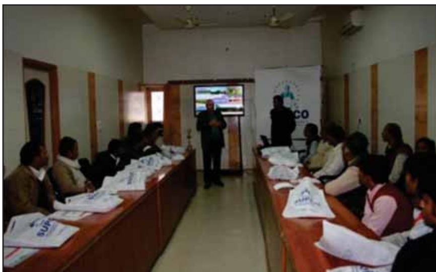
Skill Operators Training at Agra (U.P.) at the request of respective Cold Storage Associations

for cold storage, the Board during the year under report organized training programmes for the Cold Storage Operators (seven batches) to cope-up with the additional requirement of human resource development for operating the projects as per technical standards & specifications.