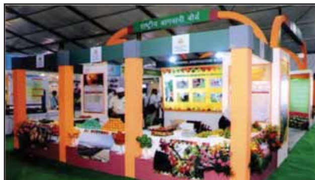
NHB's Participation in Krishi Vasanth at Nagpur, Maharashtra (9th-13th February, 2014)